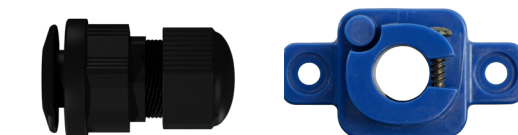
Gland Nut (left) or °C Clamp (right) fitment options available